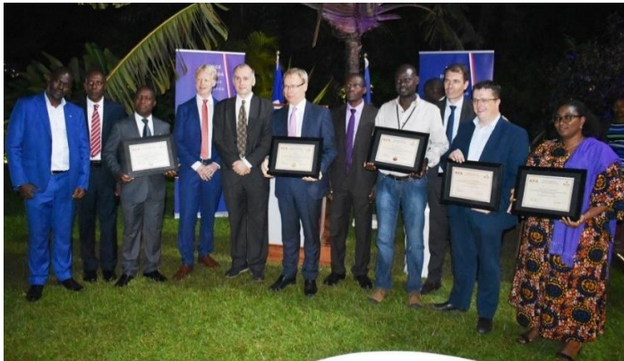
Representatives from the finalist missions (R-L): Kenya, British, France, Sweden, UNDP and other dignitaries at the French residence

Ten diplomatic missions participated in the inaugural Green Embassy Award competition, codenamed Diplo4Climate 2018 six of which made it to the final stage of evaluation.